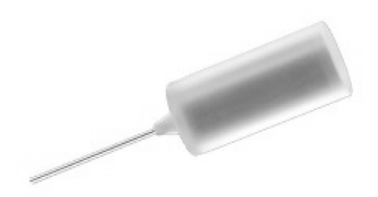
Fiber end cap